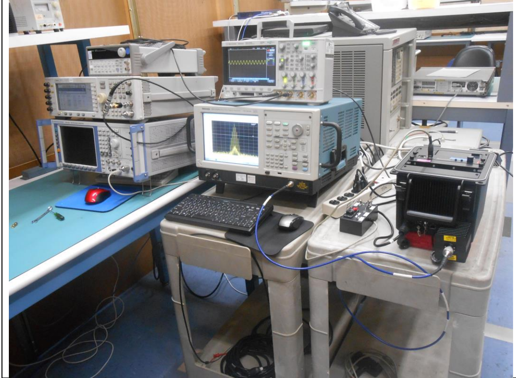
RF Conducted #2