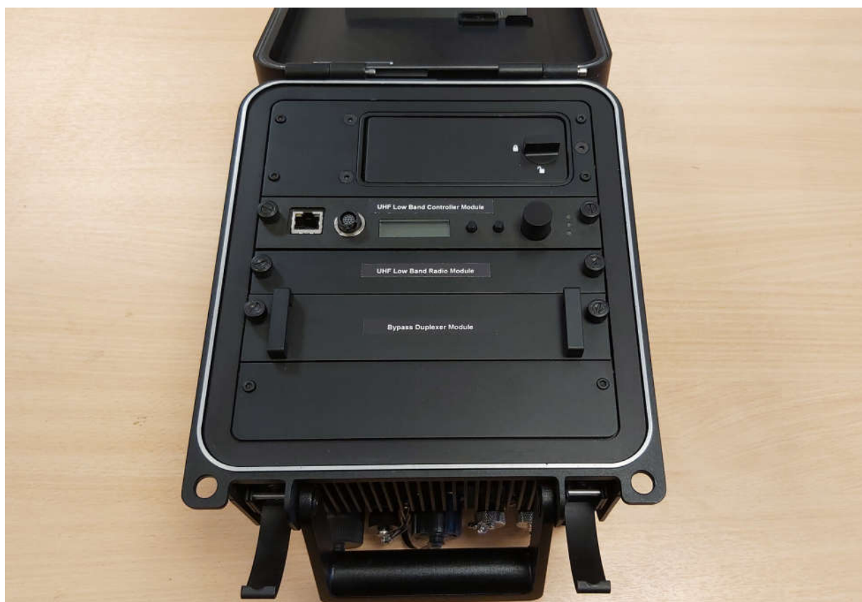
Photo 6 Two External RF Ports and No Internal Duplexer (Configuration 2) with Duplexer Bypass Module Fitted.

Note: The external appearance is similar to the original filing. The main change is the two ports on the front panel. The internals of the Duplexer Bypass Unit have changed.