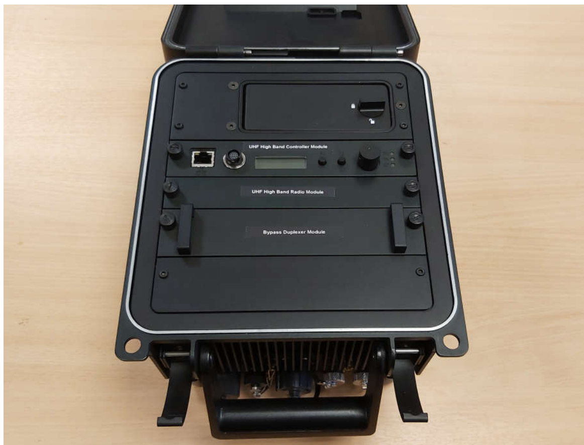
Photo 6 Two External RF Ports and No Internal Duplexer (Configuration 2) with Duplexer Bypass Module Fitted.

Note: The external appearance is similar to the original filing. The main change is the two ports on the front panel. The internals of the Duplexer Bypass Unit have changed.