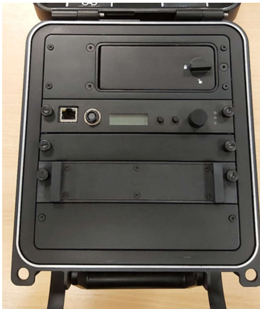
Photo 5 Single External RF Port and Internal Duplexer (Configuration 1) with Duplexer Module fitted

Note: The external appearance is the same to the original filing, the only change is from Duplexer Bypass Module to a Duplexer Module. The Duplexer Module has an internal duplexer. The module differs from the Duplexer Bypass Module in that the module has a faceplate which is fixed with screws for servicing access to the internal duplexer part.