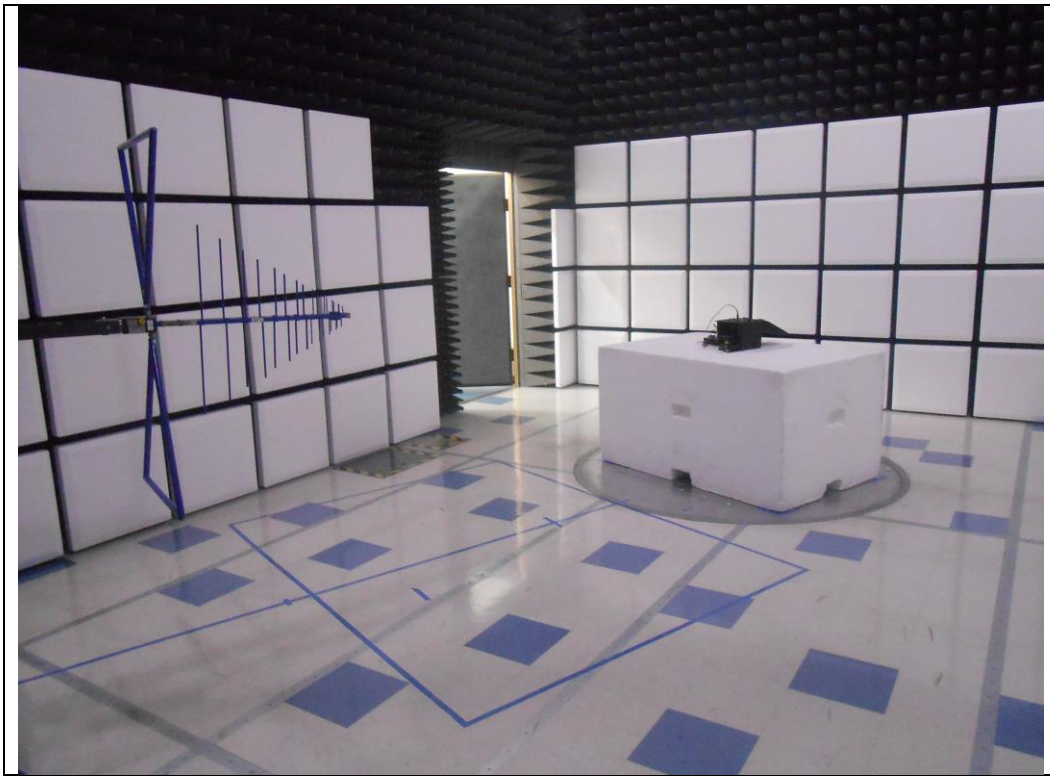
RF Radiated #2