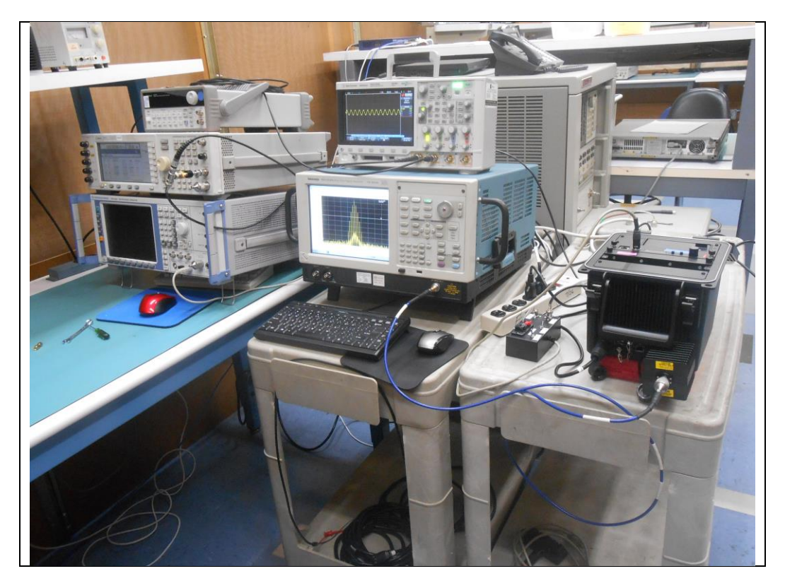
RF Conducted #2