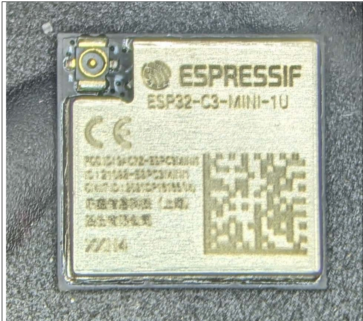
Module Top – Shield In Place