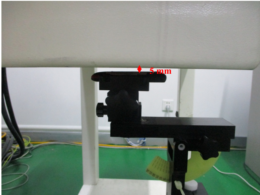
Body(Worn) Back Headset attached Setup Photo(5mm)