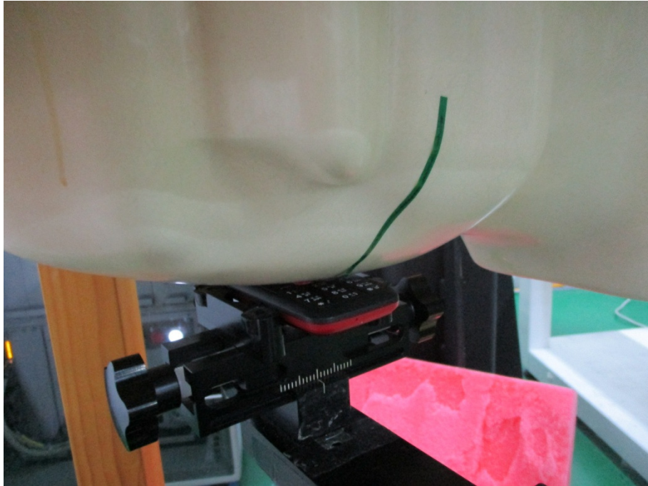
Head Right Tilt Setup Photo