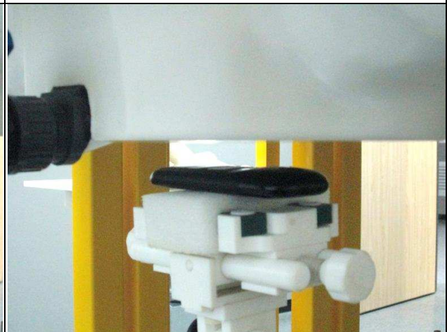
Rear Face of EUT with 1.5 cm Gap