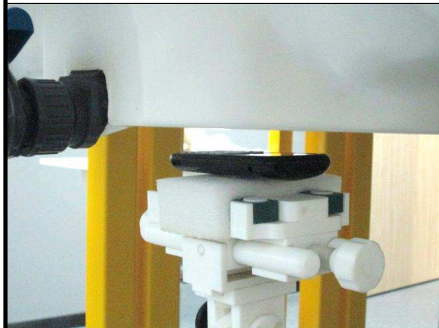
Front Face of EUT with 1.5 cm Gap