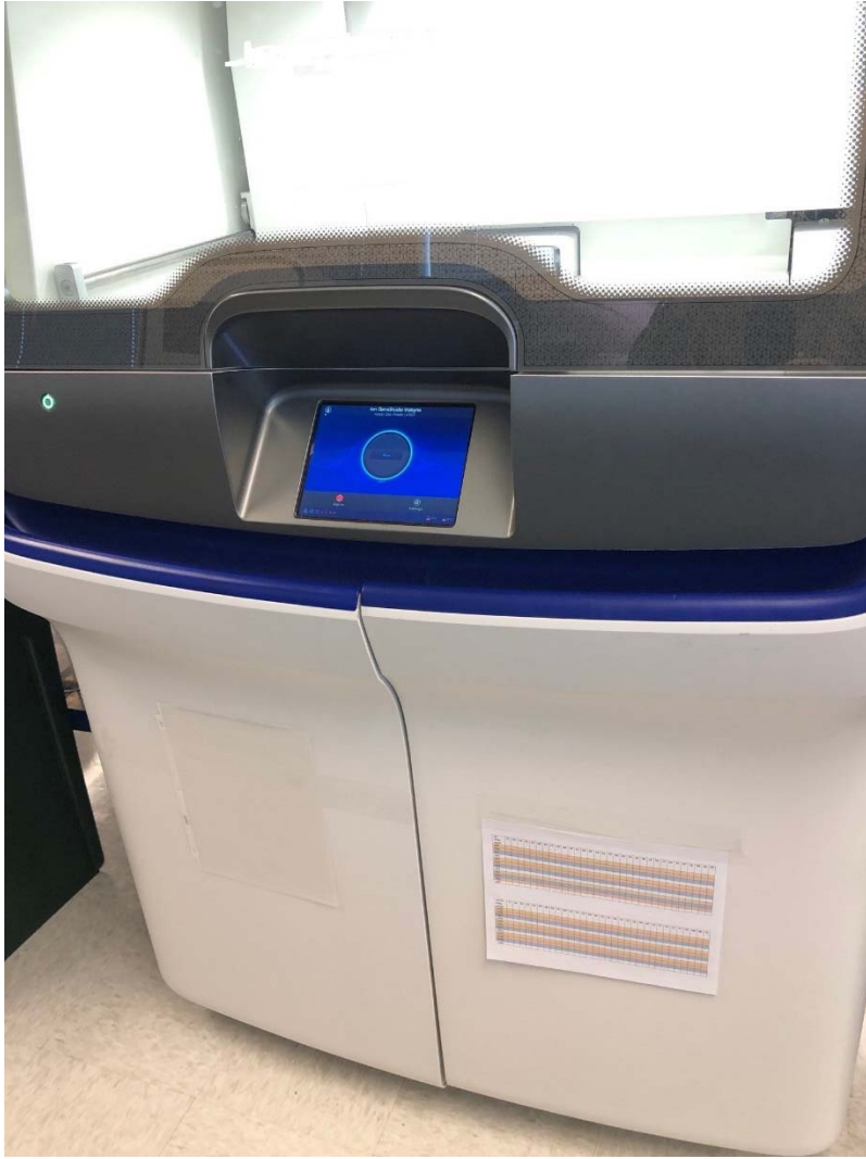
External photo of host instrument