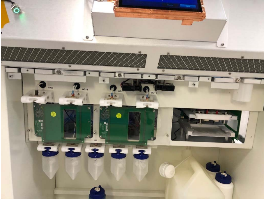
Internal photo #1 (RFID boards 1 and 2)