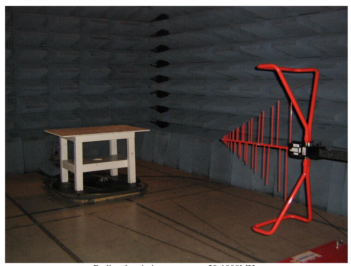
Radiated emissions test setup 30-1000MHz