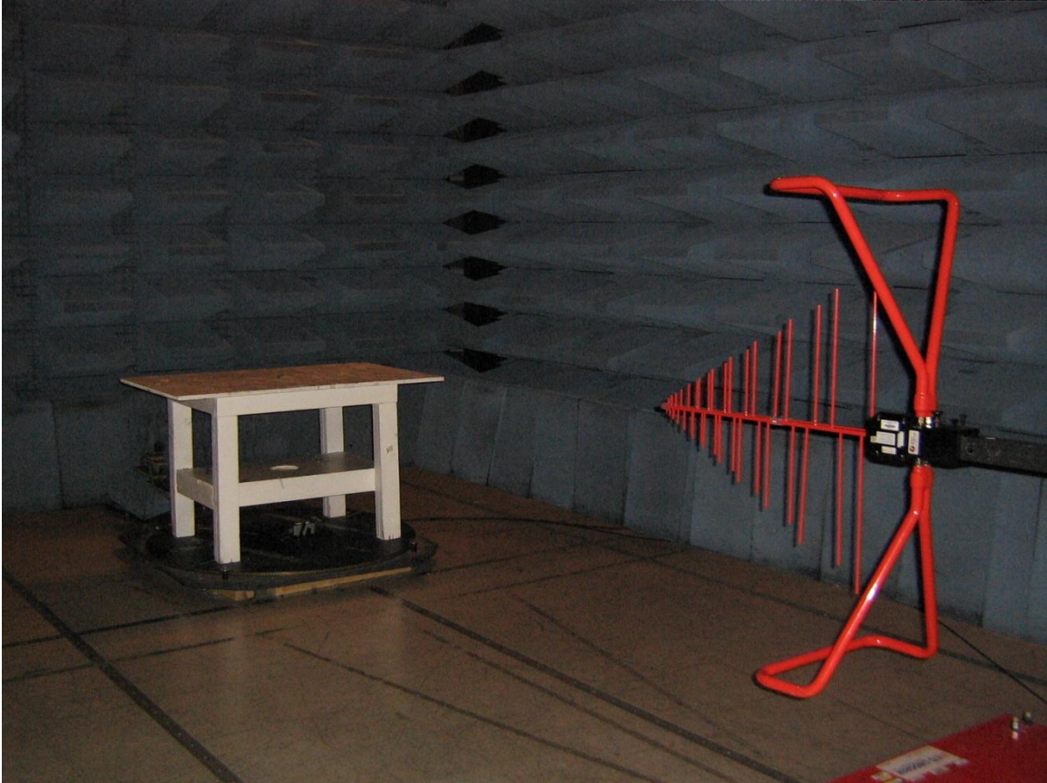
Radiated emissions test setup 30-1000MHz