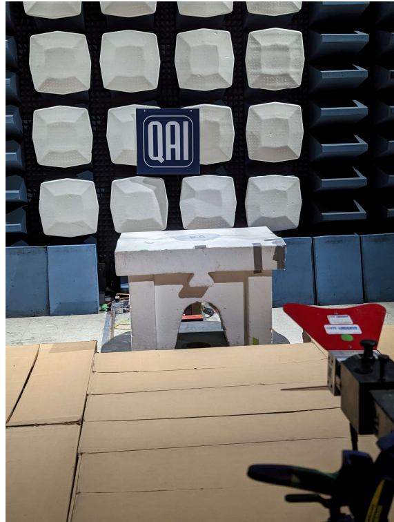
Figure 14: Radiated Emissions from 1 GHz to 6 GHz Setup