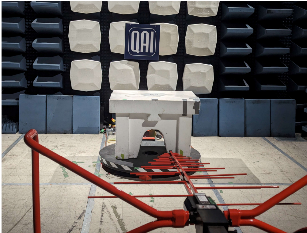
Figure 13: Radiated Emissions From 30 MHz to 1000 MHz Setup