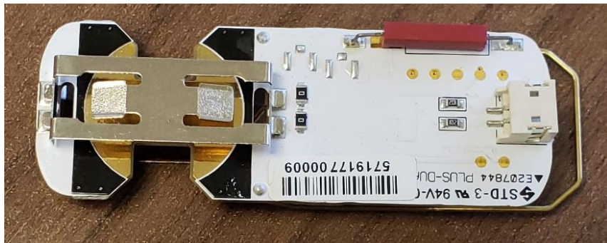
VERSAHP Bottom Side of PCB