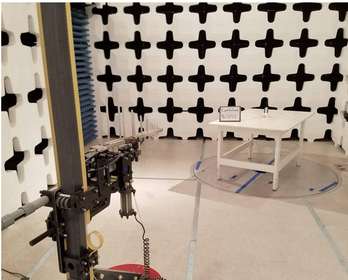
Figure 2. Radiated Emissions Test Setup – 200 Mhz – 1000 Mhz

FCC Part 15 Certification 2AD9R-CO1301 20355-CO1301 16-0122 June 27, 2016 Controlant EHF CO 13.02