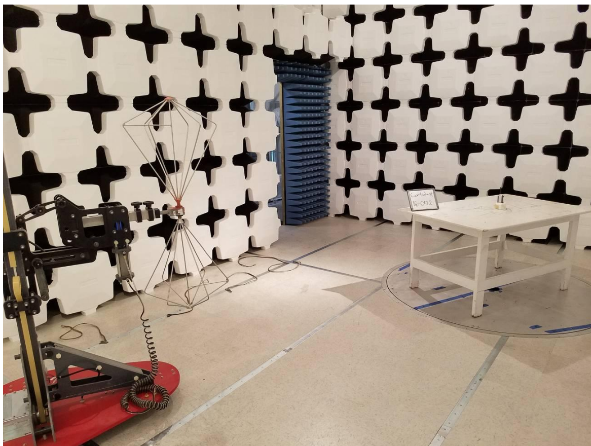
Figure 1. Radiated Emissions Test Setup – 30 – 200 Mhz