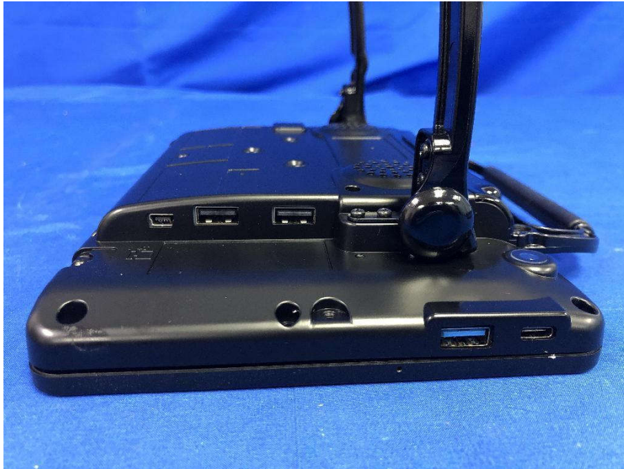
View of Product-11