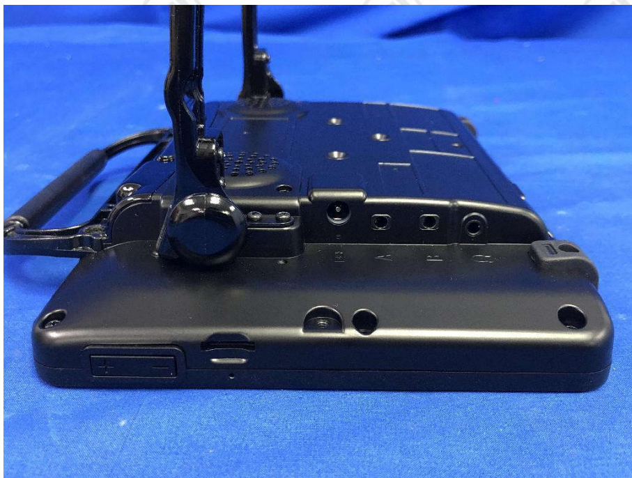
View of Product-10