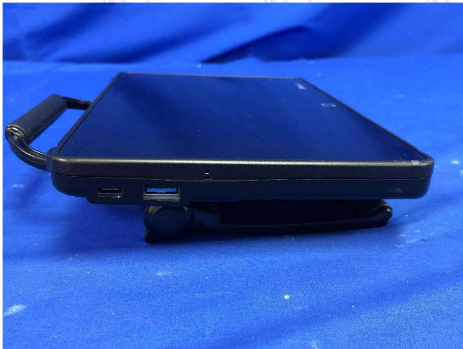
View of Product-8