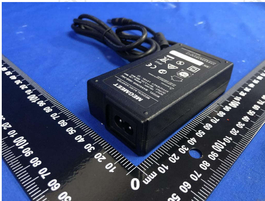
View of Product-14