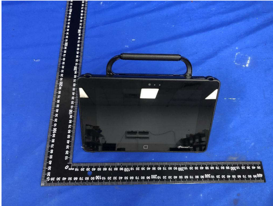
View of Product-7