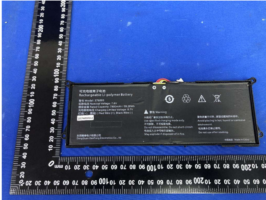
View of Product-13