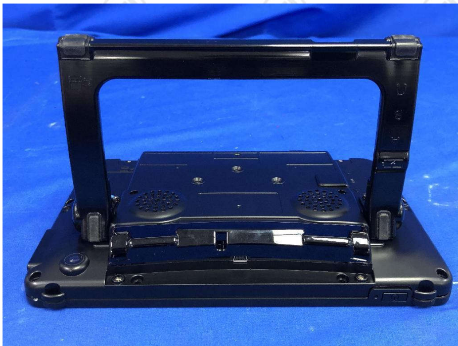
View of Product-12