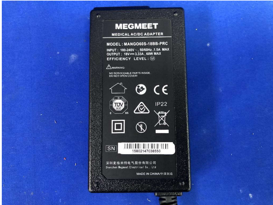
View of Product-15