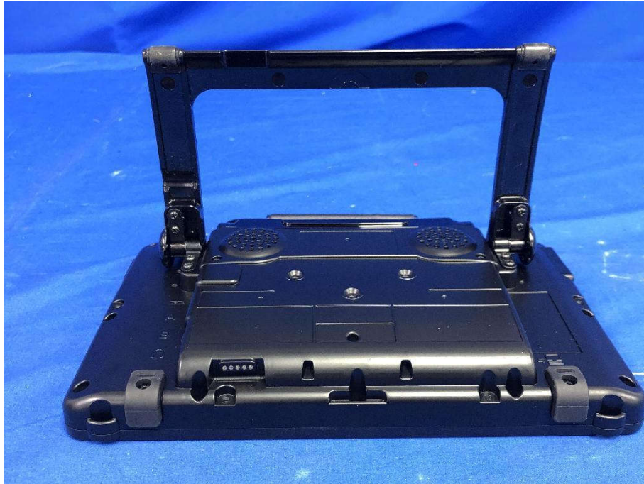
View of Product-9