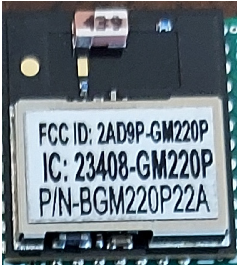
Sample Label Location