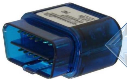
Danlawinc's Data Logger