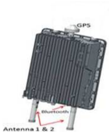
Omni Configuration 1 and 2