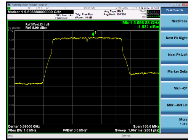
Channel 155+138 (5690MHz) - Ant 1