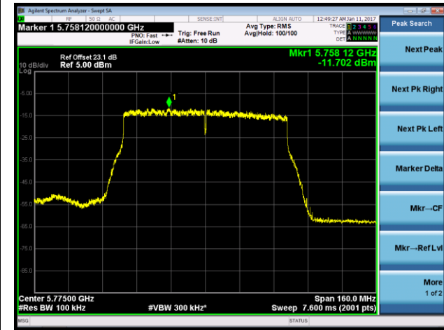
Channel 155+138 (5775MHz) - Ant 3