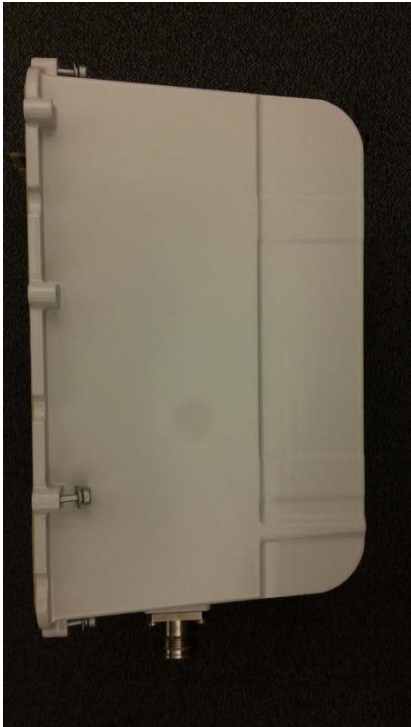
RF Module Back and Front long side views