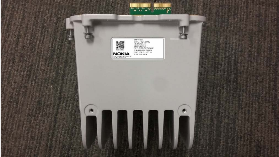
RF Module Bottom View