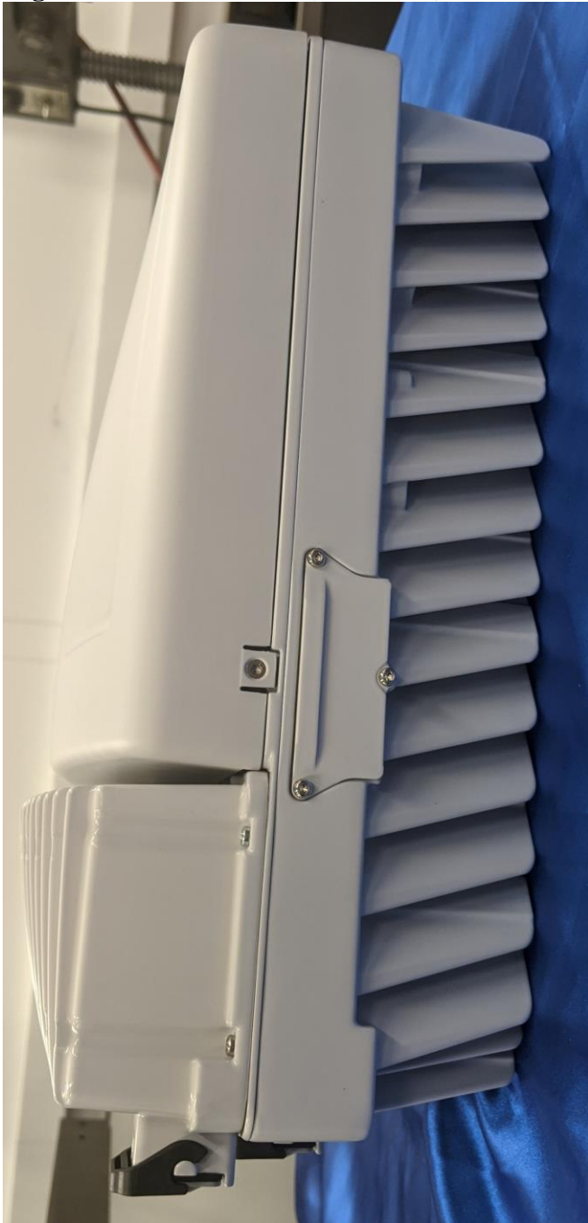
Right Side AWEWA/B (Base Unit)