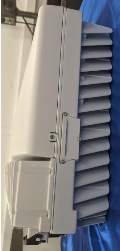
Right Side AWEUC/D (Base Unit)