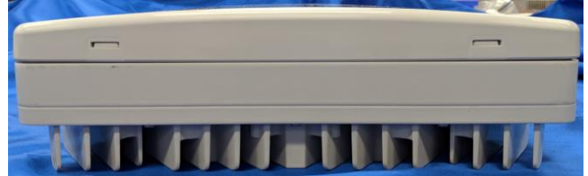
Top View FA3UA (Extension Module)