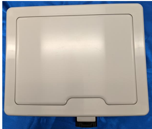
Front View FA3UA (Extension Module)