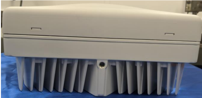
Top View AWEUC/D (Base Unit)