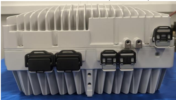
Bottom View AWEUC/D (Base Unit)