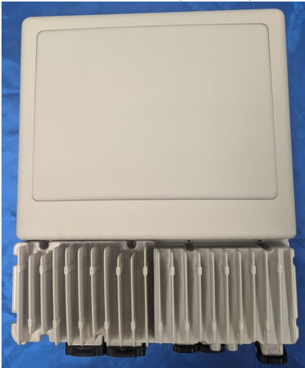
Front View AWEUC/D (Base Unit)