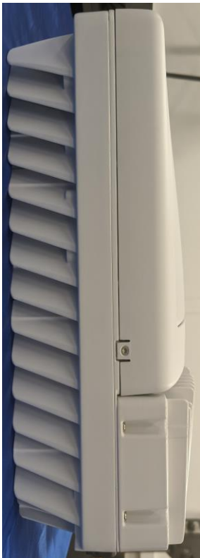
Left Side AWEUC/D (Base Unit)