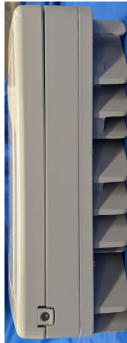
Right Side FA3UA (Extension Module)