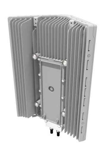
AEUE (extension module)