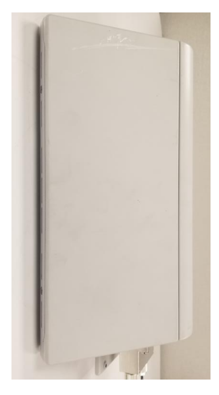
AEUE (extension module)