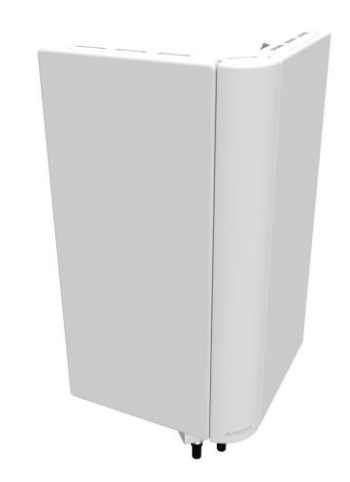
AEWE (extension module)