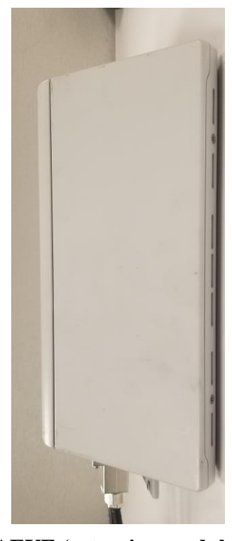
AEUE (extension module)