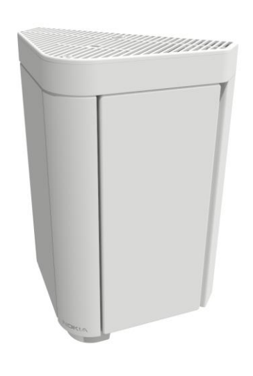
AEWD Rear View AEUD & AEUE