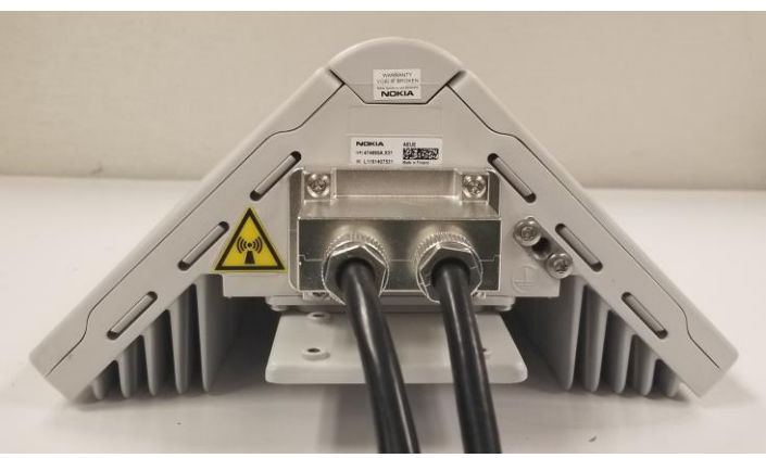
AEUE (extension module)