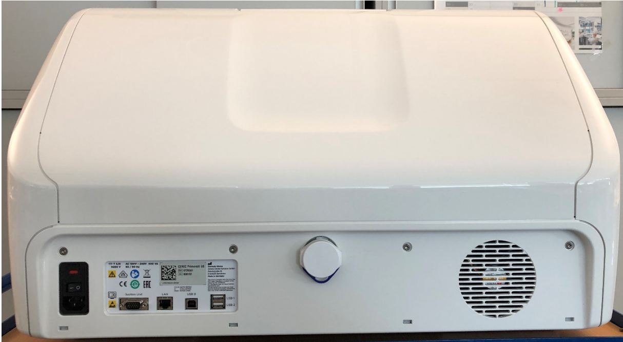
Pict. 4: Backside