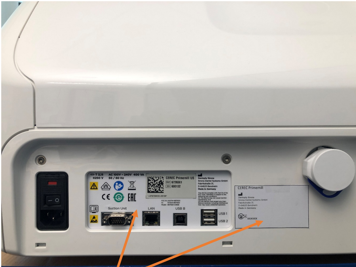
Pict. 6: Label on the Backside