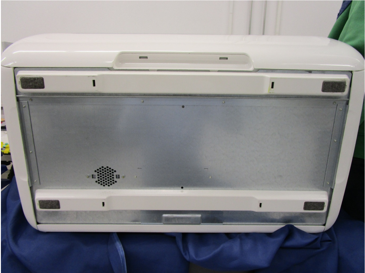
Pict. 8: Bottom Side