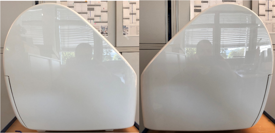
Pict. 2: Right Side