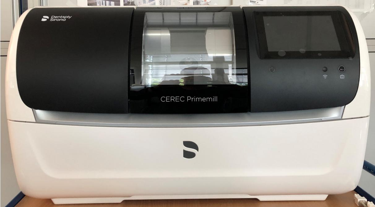
Pict. 1: Front Side. The width of the machine is 730 mm and the height is 454 mm

This document describes the CEREC Primemill by pictures. The main dimensions are given below the pictures.