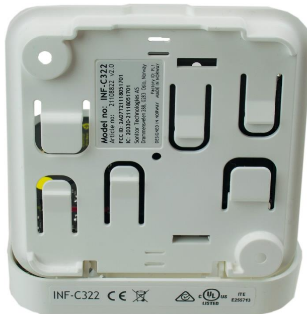
Figure 6 Product label located on the back of the product. Approval label located on the edge of the top compartment.