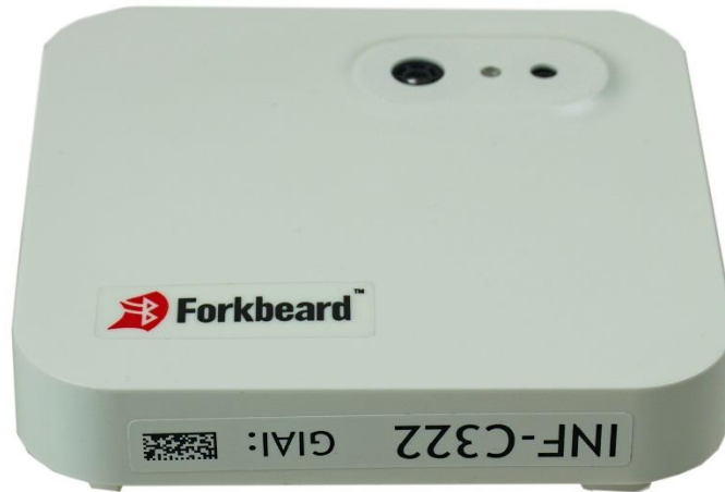
Figure 5 GAI label located on the edge of the top compartment