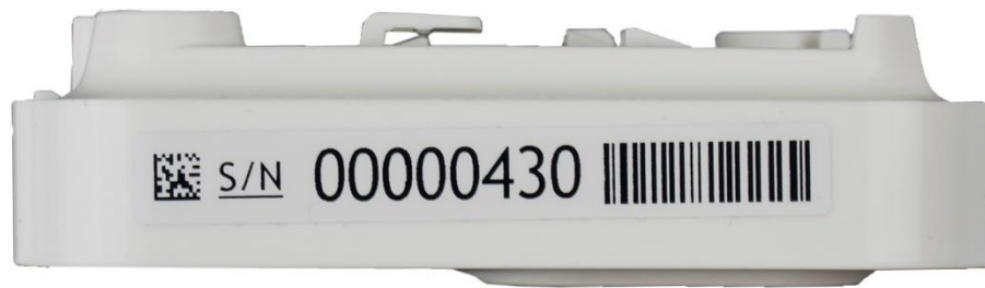
Figure 7 Serial number label located on the edge of the top compartment