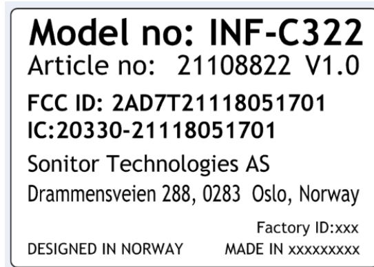
Figure 1 Product label, 20 x 28.5 mm. Field “Factory ID” and “MADE IN” are populated according to the specific factory where the product is manufactured.