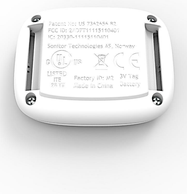
Figure 4 Tag-J131 base with FCC ID and IC, which are molded into the base enclosure