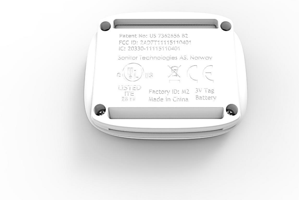
Figure 3 Tag-J120 and Tag-J130 base enclosure with FCC ID and IC, which are molded into the base enclosure.