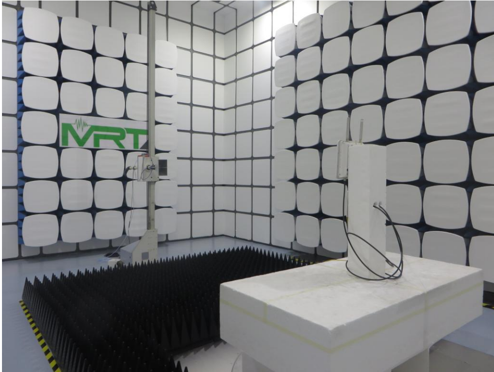
Description: Radiated Emission Test Setup for 18GHz ~ 40GHz