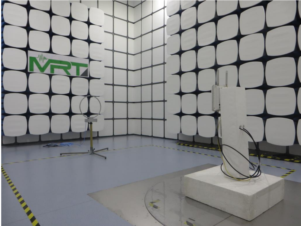
Description: Radiated Emission Test Setup for 30MHz ~ 1GHz