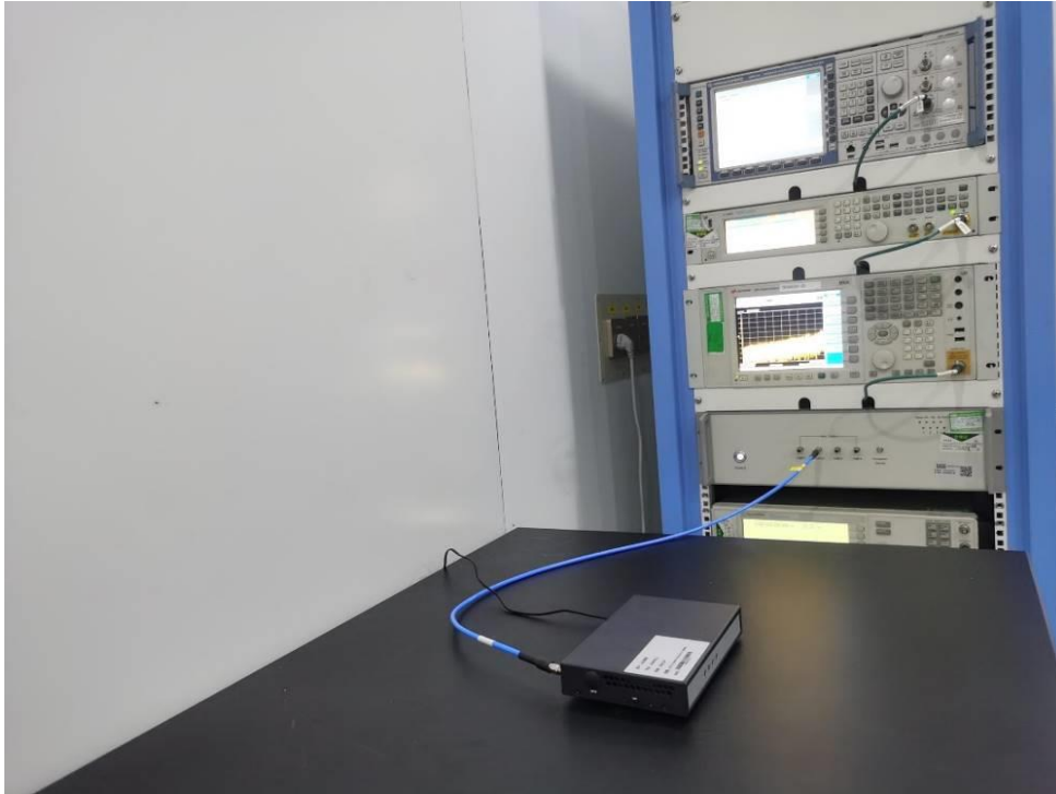
RF Conducted Test Setup