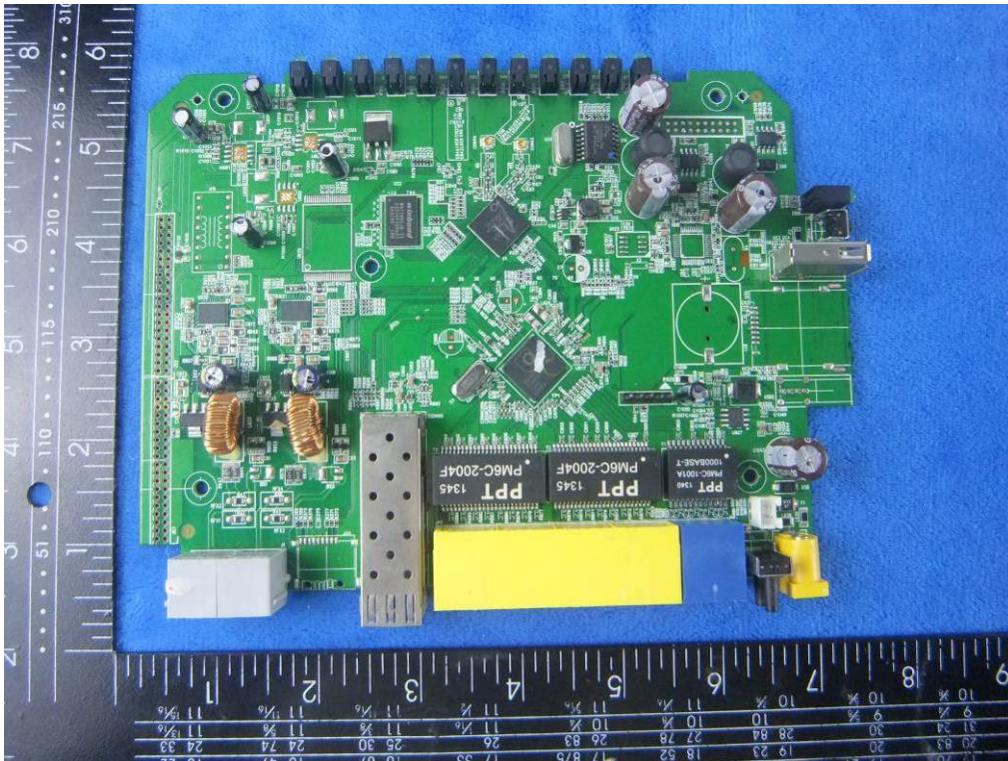
Top View of Mainboard