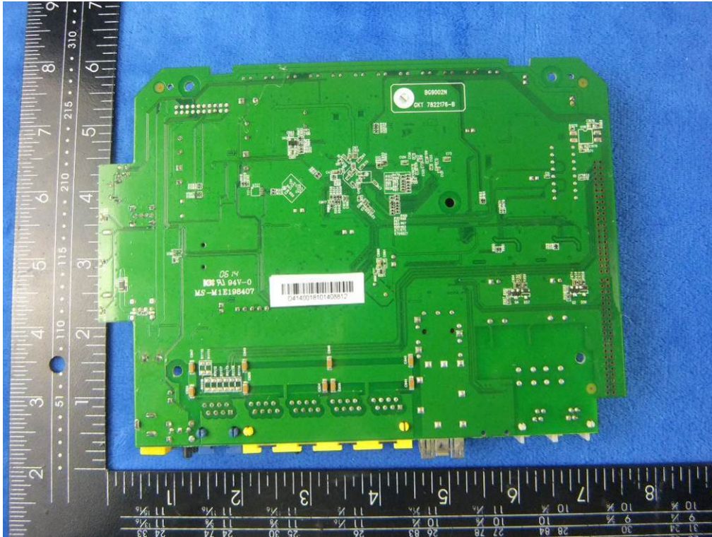
Bottom View of Mainboard