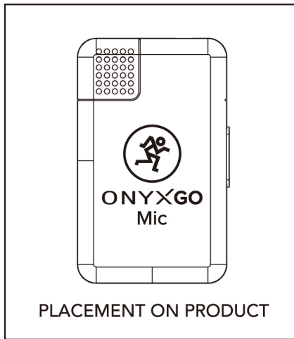
PLACEMENT ON PRODUCT