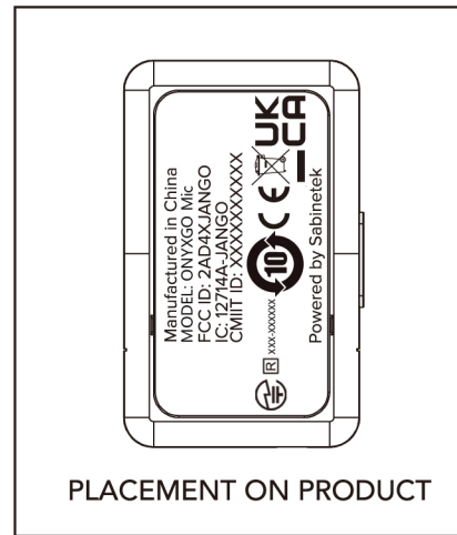
PLACEMENT ON PRODUCT

SILKSCREEN INK: PANTONE PROCESS BLACK SATIN FINISH