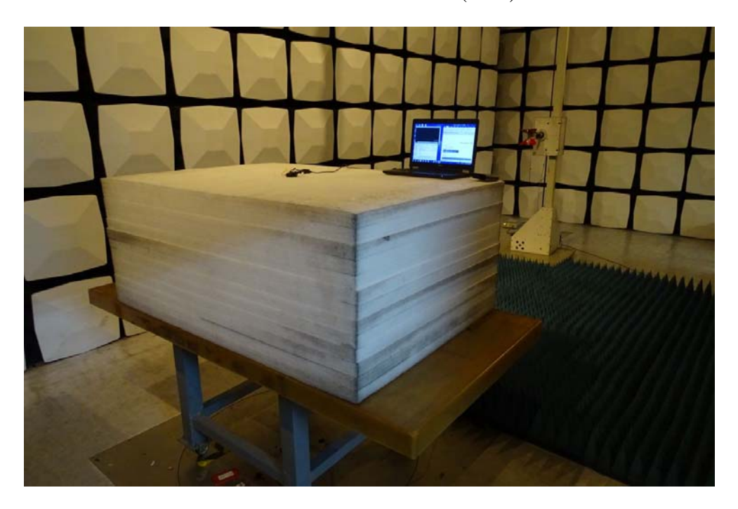
Back View of Radiated Test (Horn)