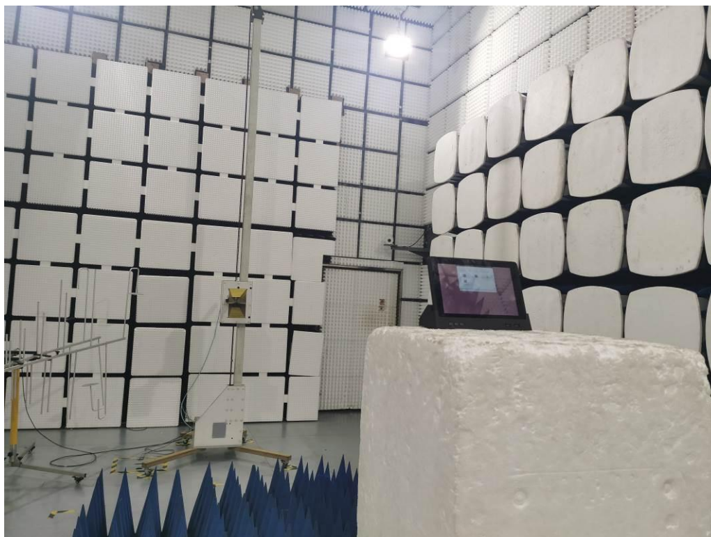
Fig. 2 (Above 1GHz)