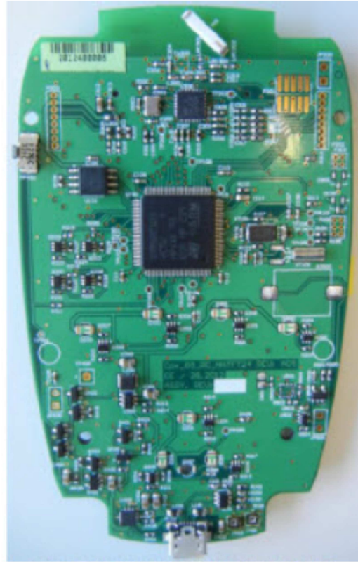
G9_RC_HHTFT24_PCBA_V2 BOTTOM SIDE