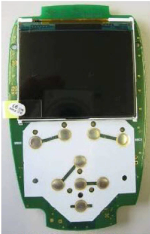
G9_RC_HHTFT24_PCBA_V2 TOP SIDE