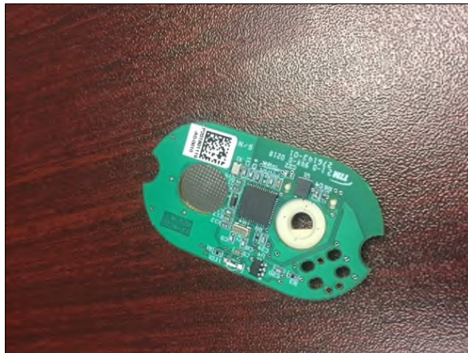
Figure 2: PCB Bottom