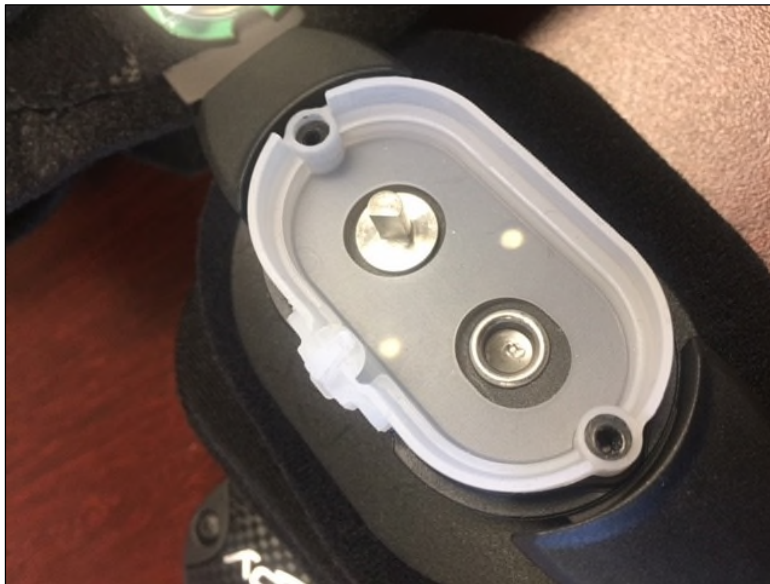
Figure 4: X4 Knee Brace without PCB installed