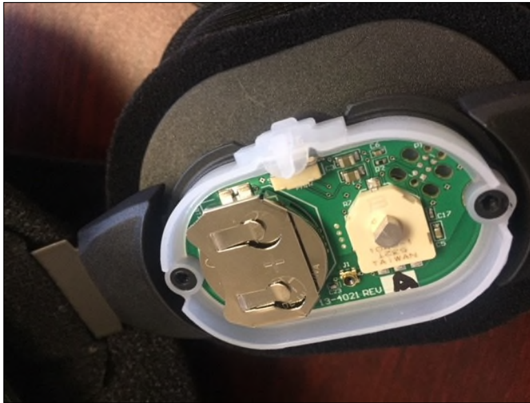
Figure 3: X4 Knee Brace with PCB installed