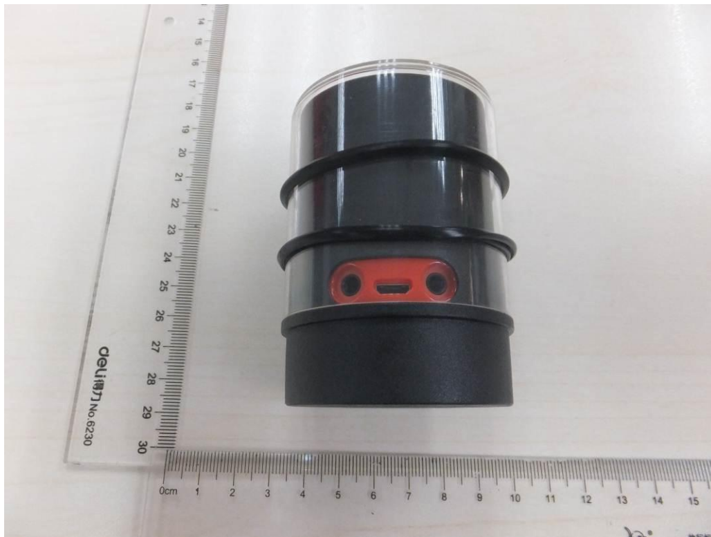
Fig. 2: External view