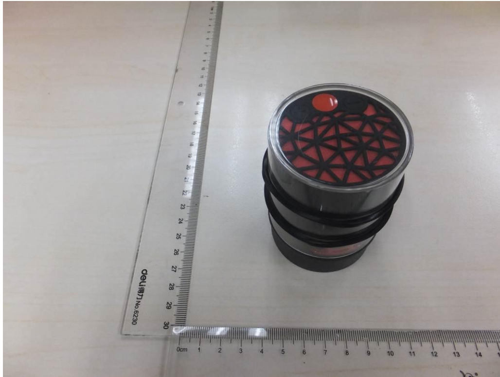
Fig. 1: External view

Type Designation: EUPHO Report Number: 17046043 001