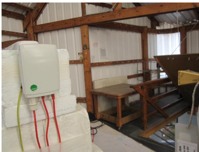
Photograph No.1 Peak output power, OBW measurement setup