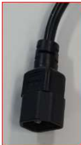
TE11 - C14