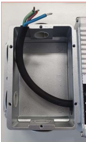
TE10 - JunctionBox

The TE11 and the HEP versions are provided with a C14 connector and are for all other cases, e.g. lockers put in front of a wall or at the end of desks. Those lockers are also often replaced by customers.