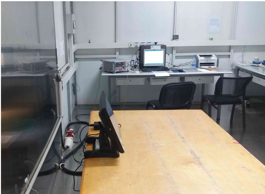
Side View of Conducted Disturbance Measurement