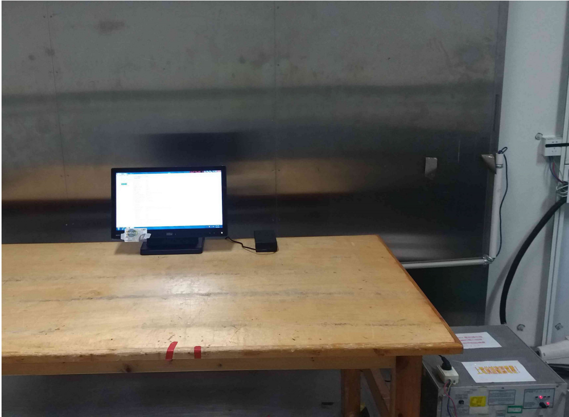
Front View of Conducted Disturbance Measurement