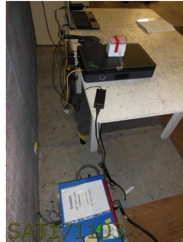
Mains Conducted Emissions – Antennas Connected