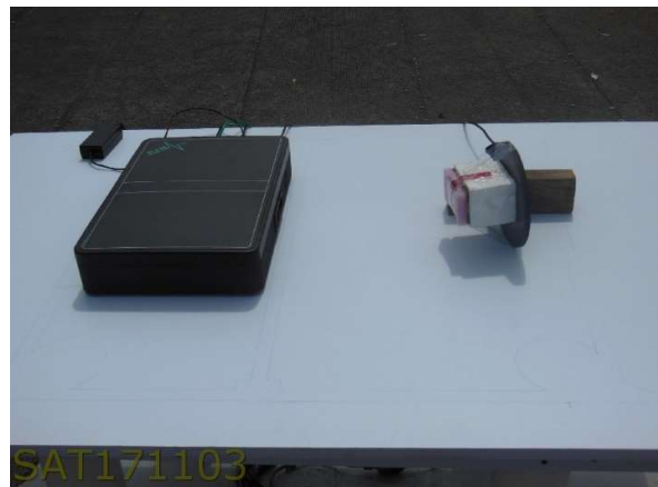
Radiated Emissions below 30MHz – External Antenna

This report is issued within the scope of A2LA accreditation #2765.02.