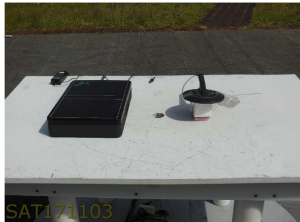
Radiated Emissions above 30MHz – External Antenna