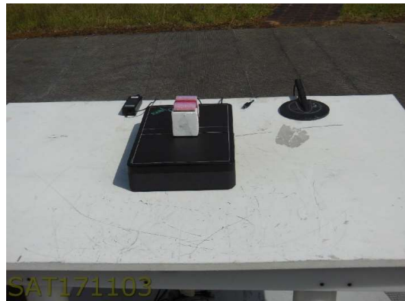
Radiated Emissions above 30MHz – Internal Antenna