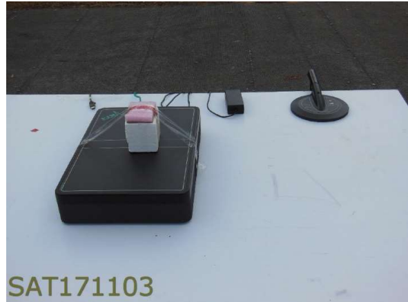
Radiated Emissions below 30MHz – Internal Antenna