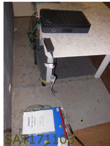
Mains Conducted Emissions – Dummy Load Connected

This report is issued within the scope of A2LA accreditation #2765.02.