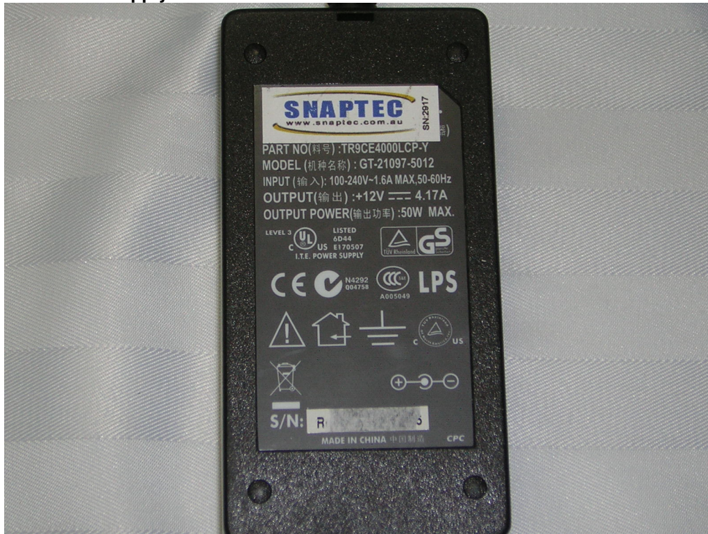
EUT Power Supply Label