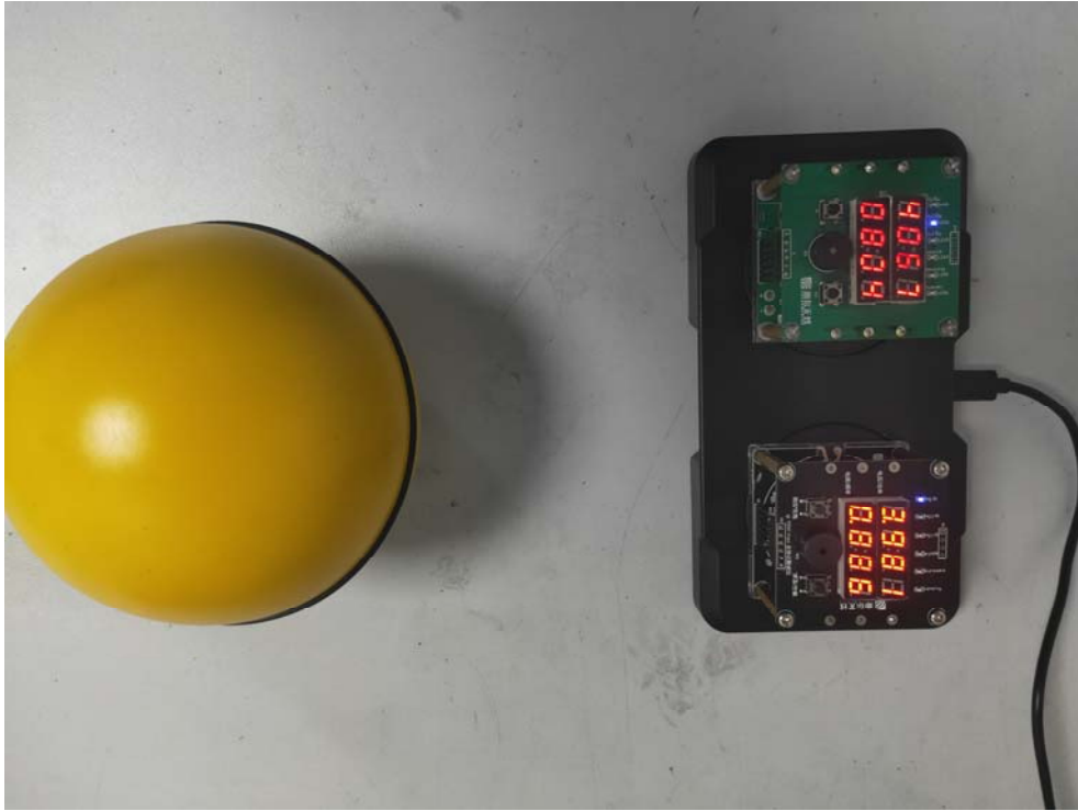
Right Side-Position C (15 cm)