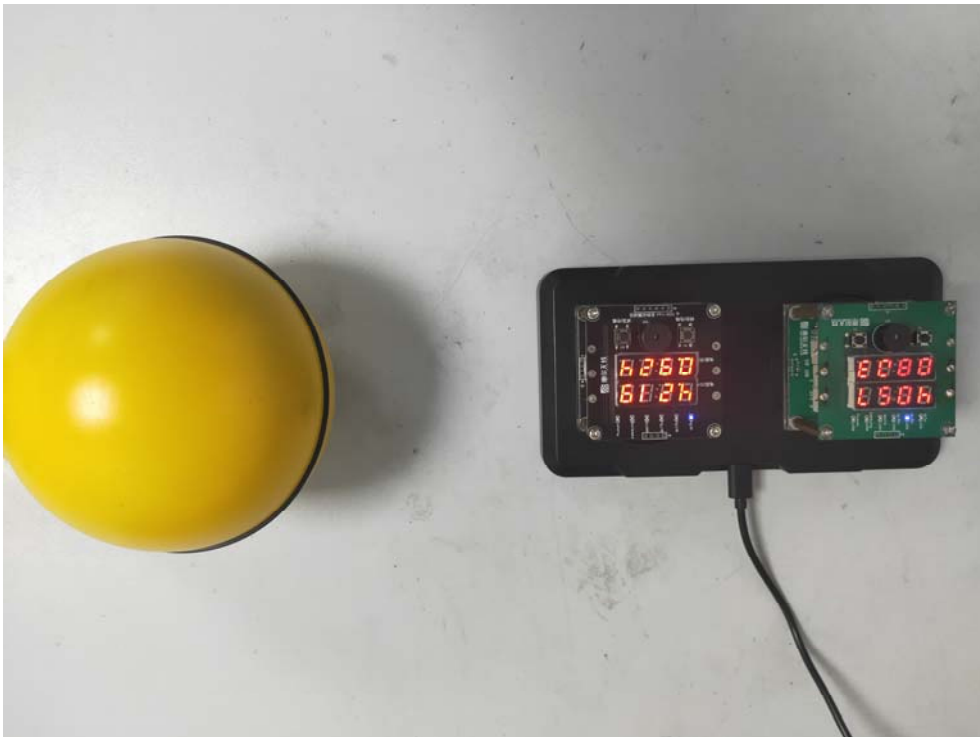
Left Side-Position A (15 cm)