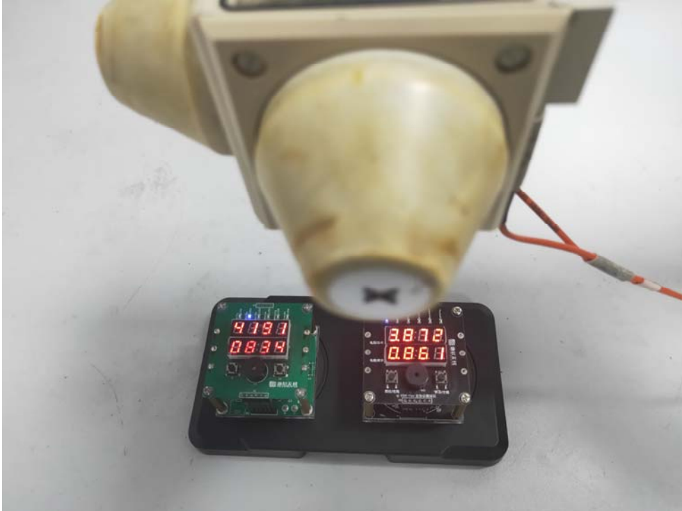
E-Field Strength View