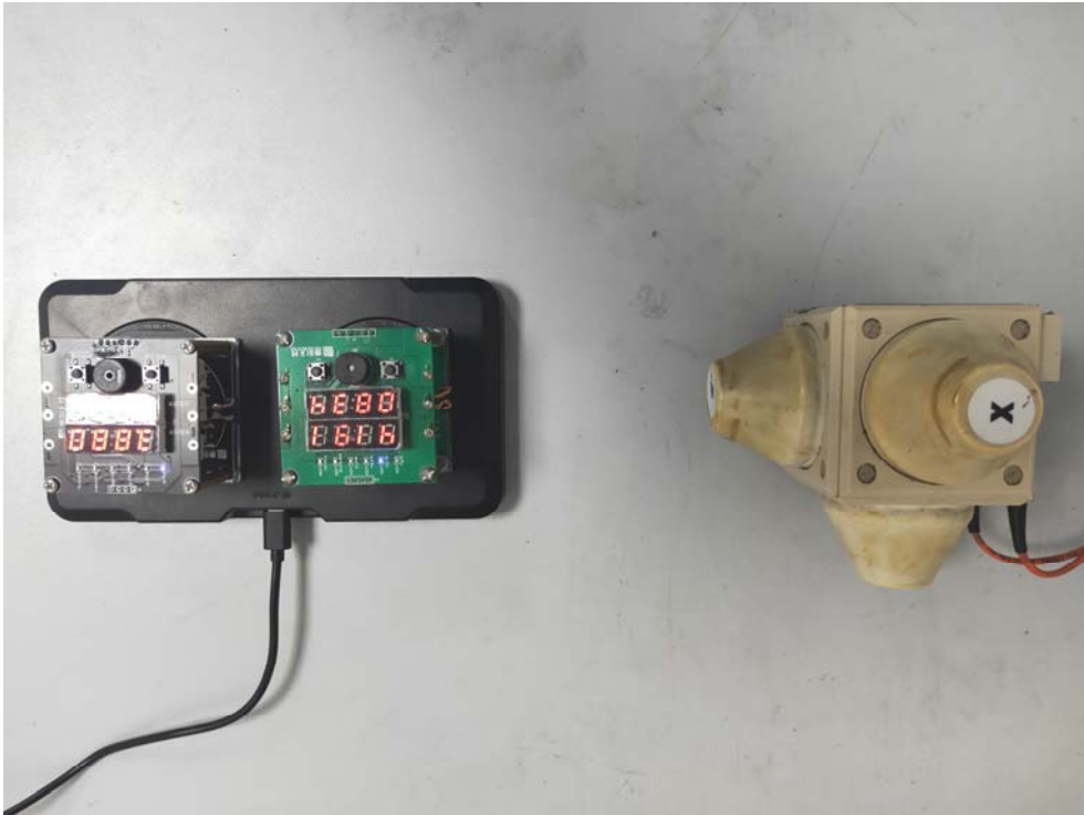
Front Side -Position B (15 cm)