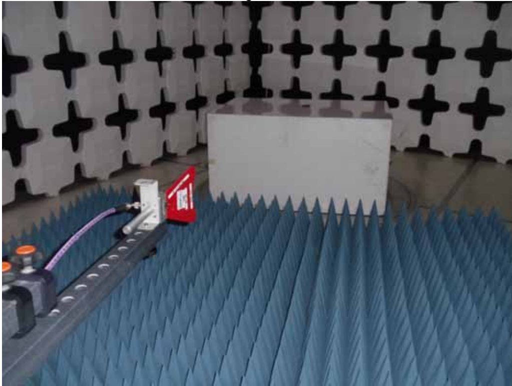
Test Setup for Radiated Emissions, 1GHz to 5GHz – Horizontal Polarization