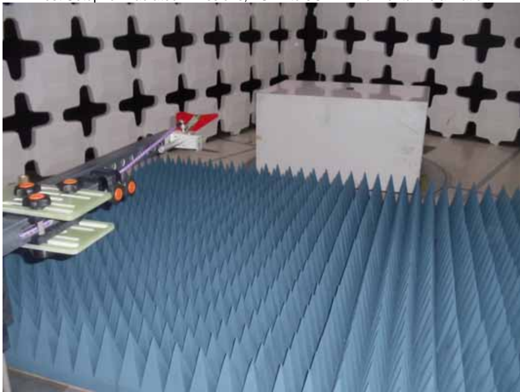
Test Setup for Radiated Emissions, 1GHz to 5GHz – Vertical Polarization