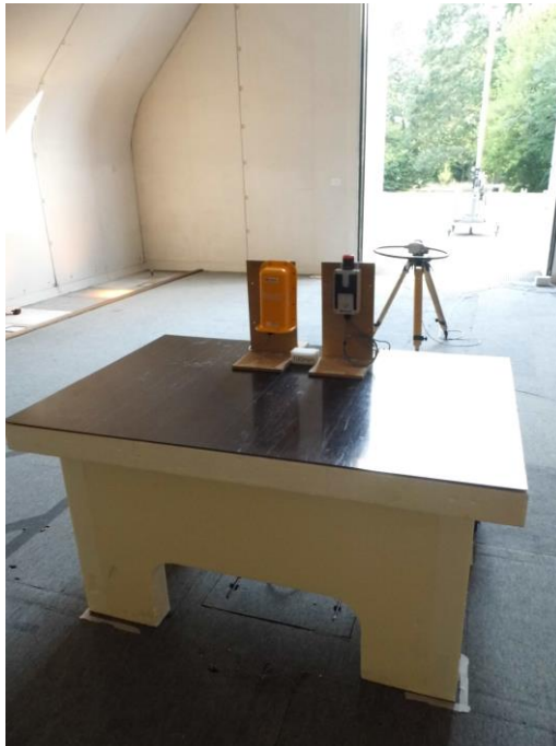
Oats Scan 3m