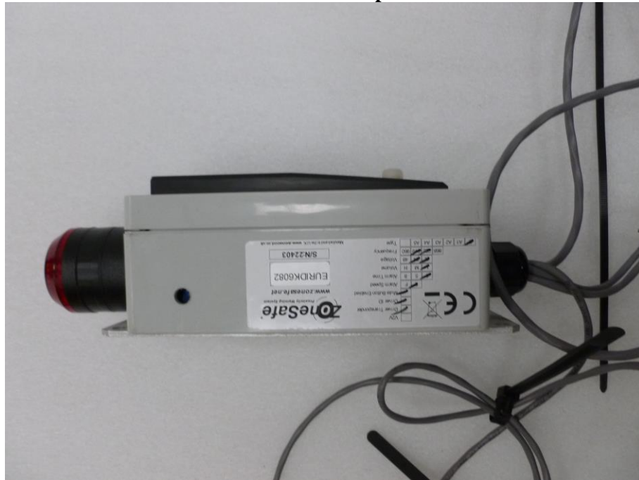
EUT Close up