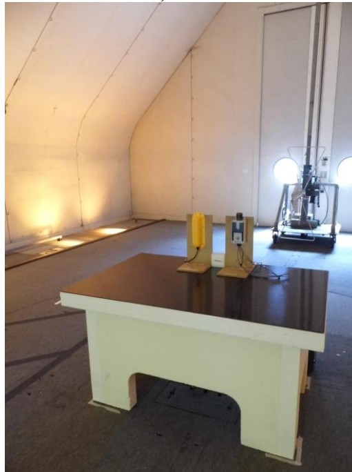
Radiated emissions, Oats 30 MHz to 1 GHz