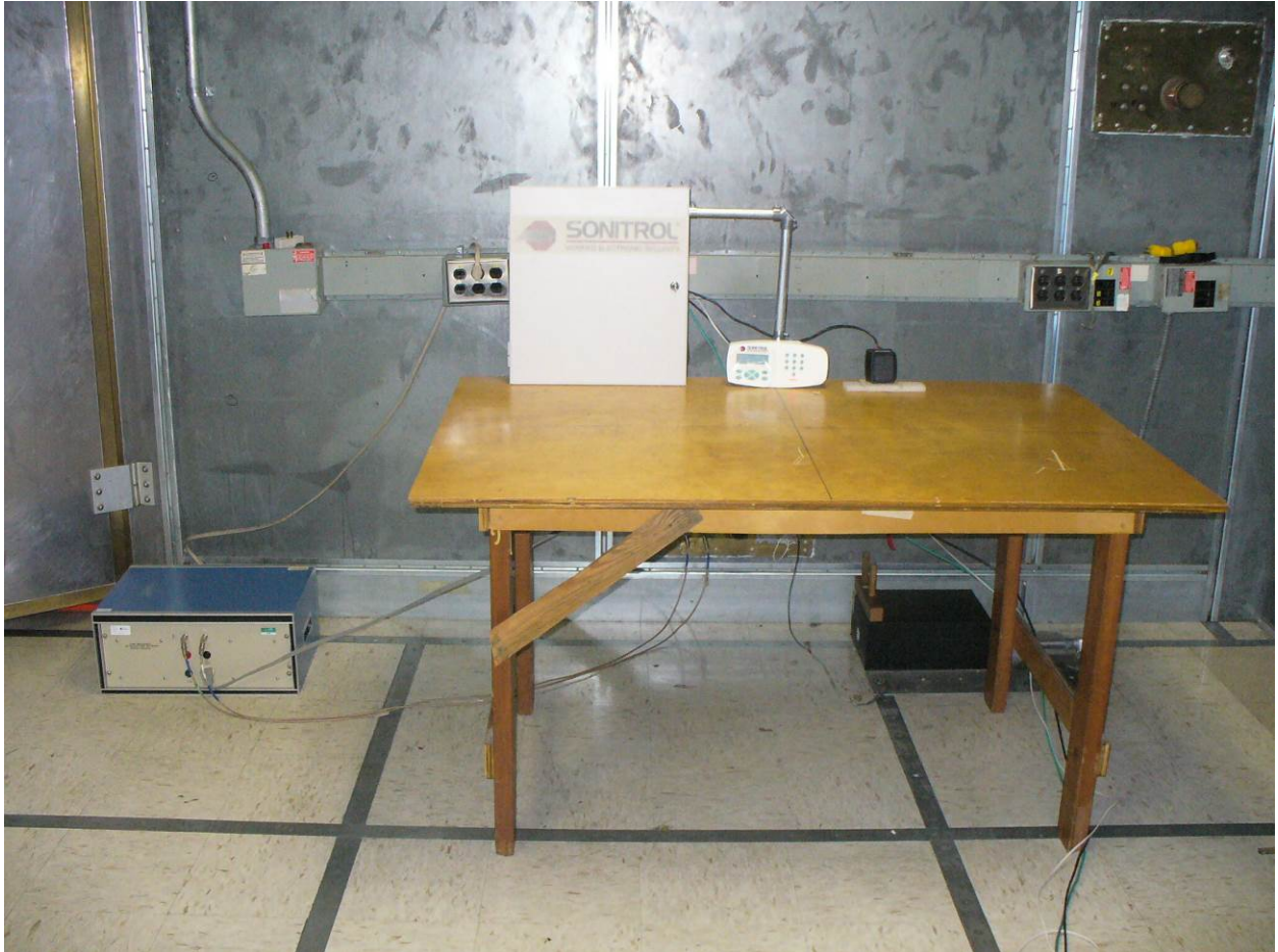
Figure 5: Power Line Conducted Emissions – Front View