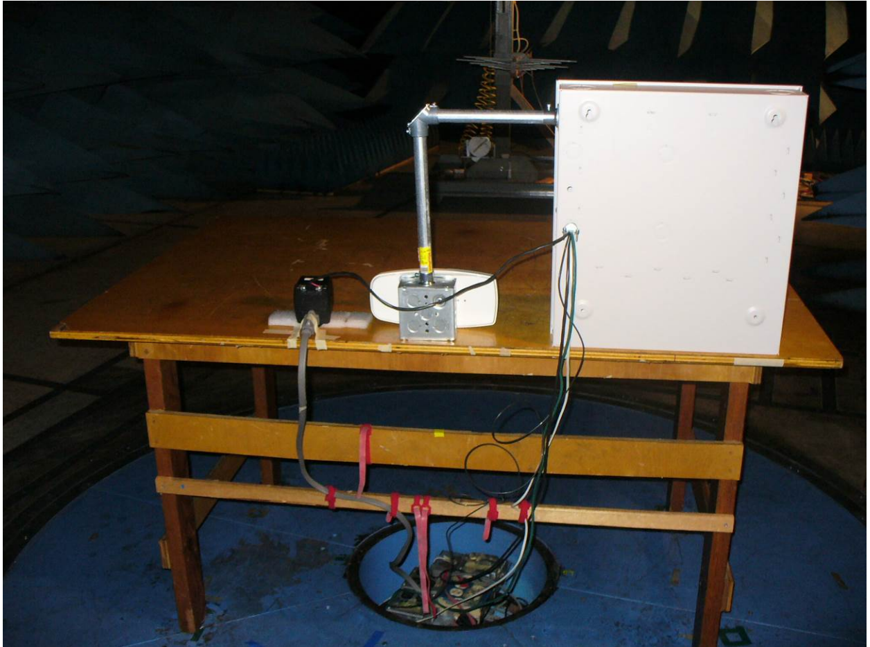
Figure 4: Radiated Emissions – Back View - 200 MHz – 1 GHz