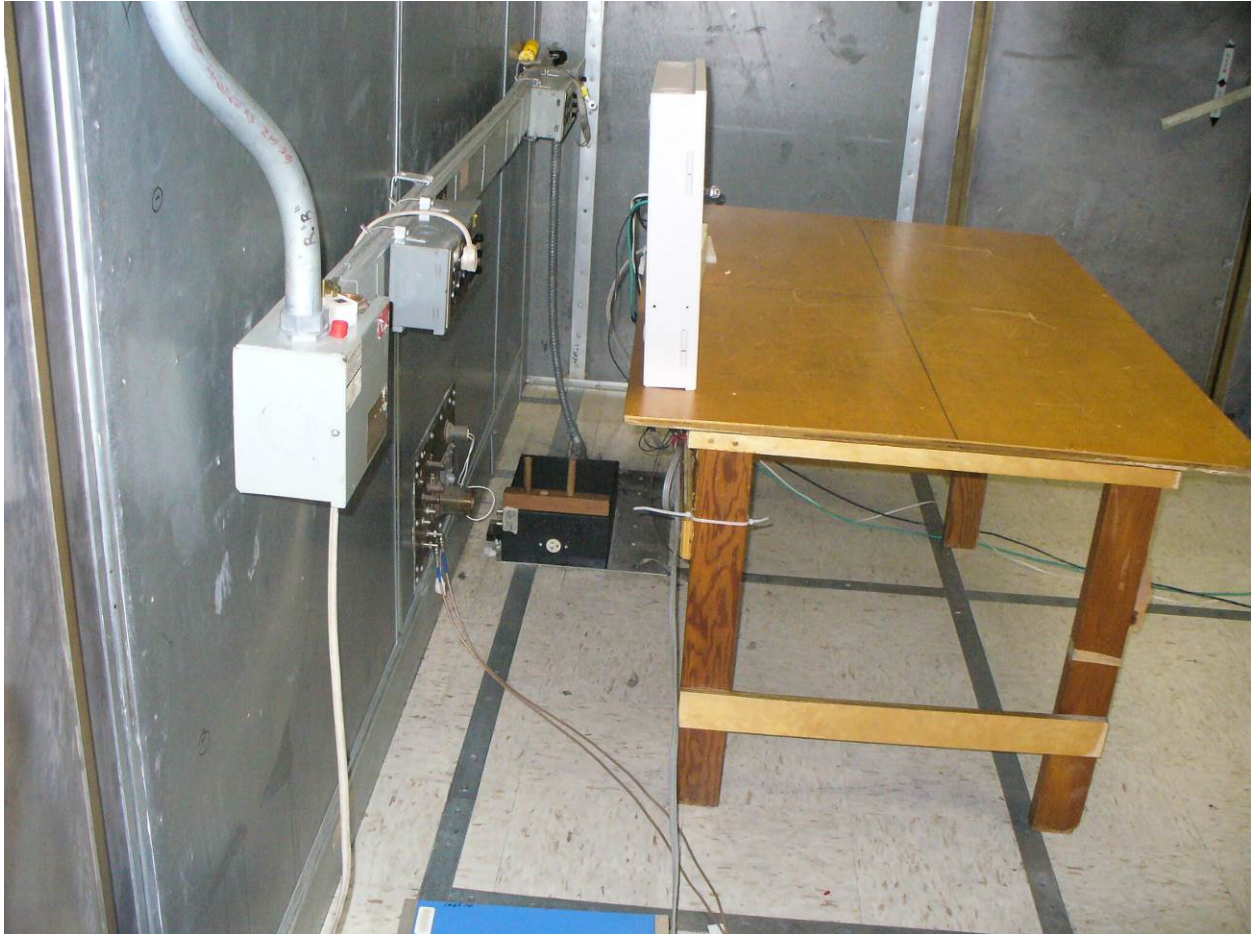
Figure 6: Power Line Conducted Emissions – Side View