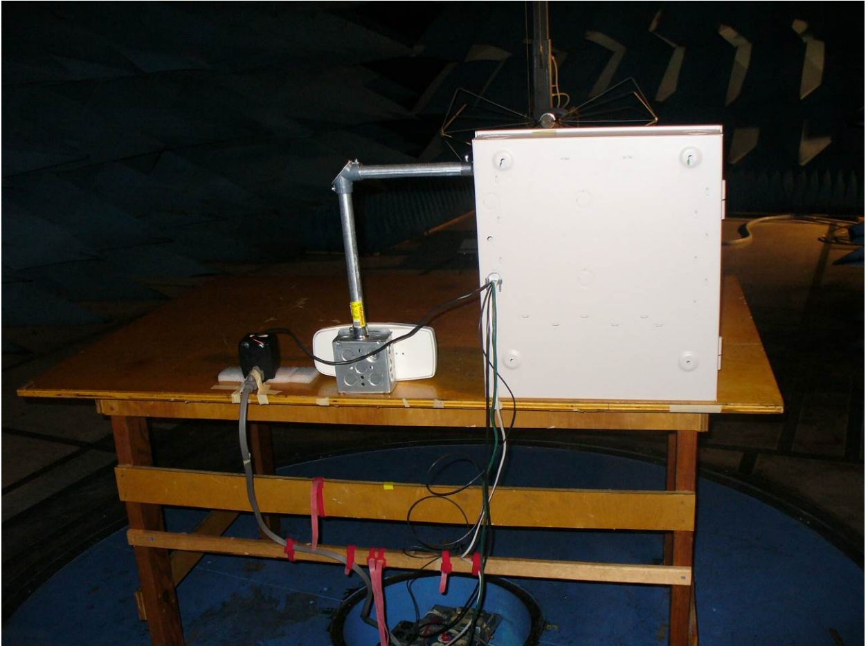
Figure 3: Radiated Emissions – Back View - 30 MHz – 200 MHz