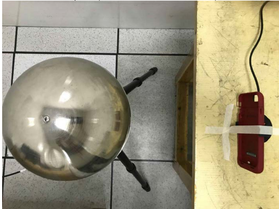
Bottom Side(measurement distance of 15cm)