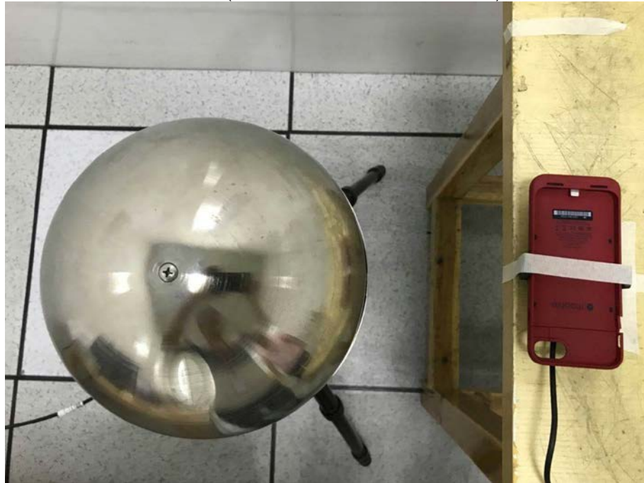
Right Side(measurement distance of 15cm)