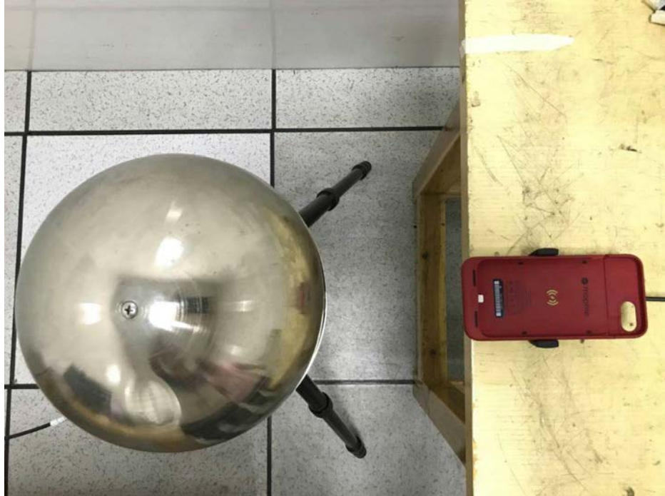
Rear Side(measurement distance of 15cm)