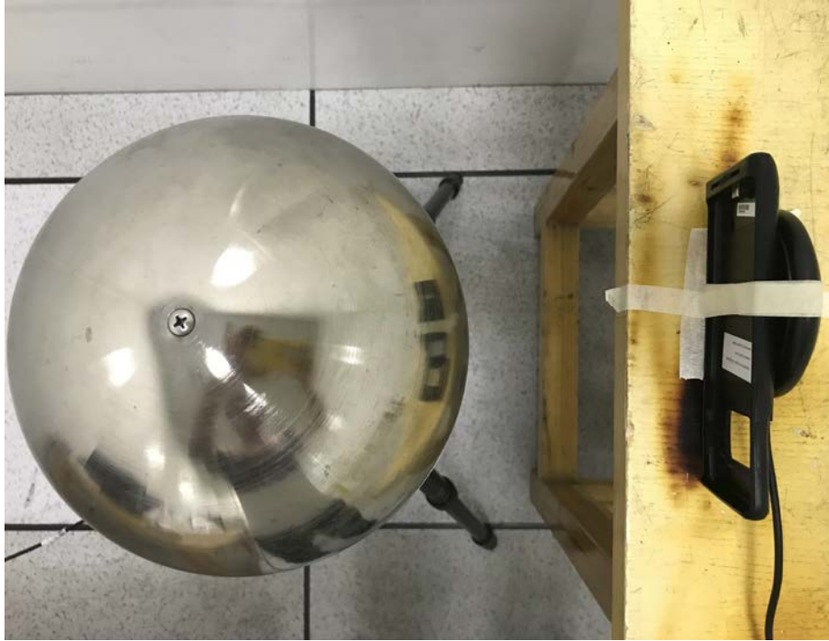
Bottom Side(measurement distance of 15cm)