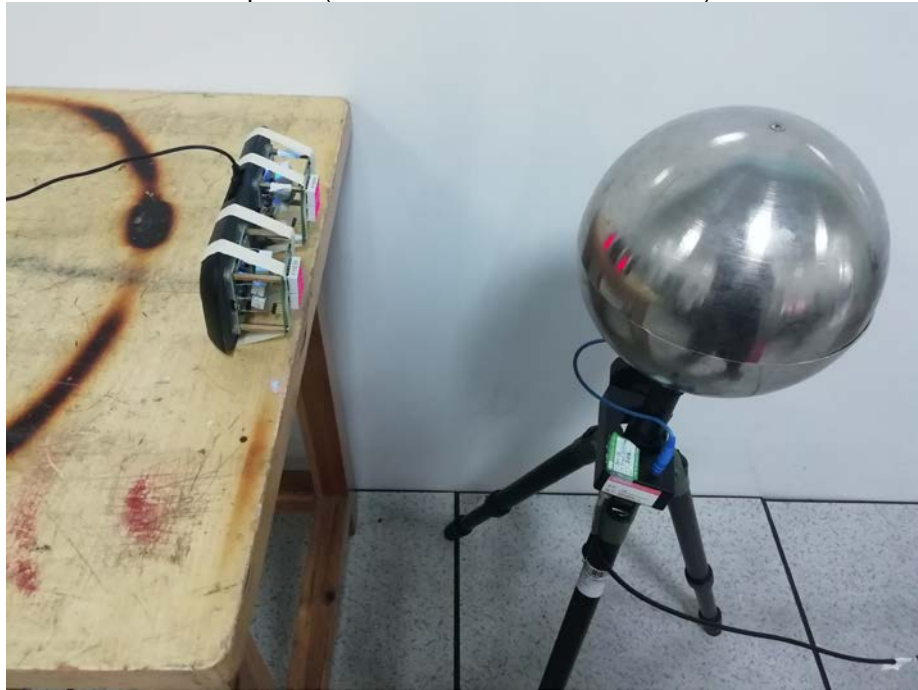
Bottom Side(measurement distance of 15cm)