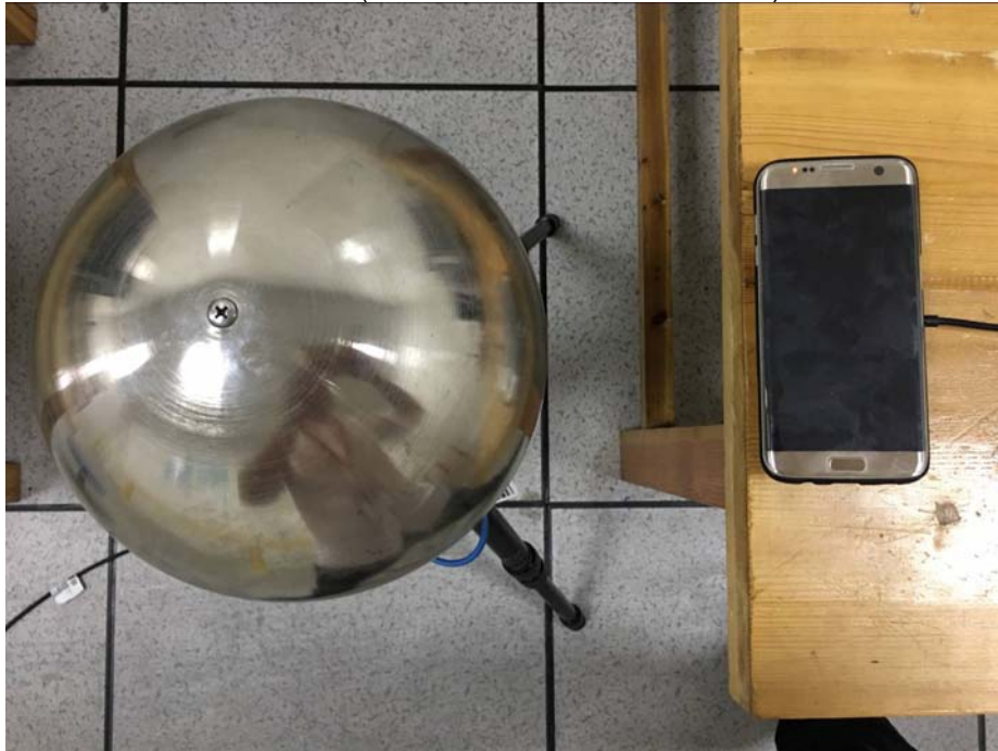
Rear Side(measurement distance of 15cm)