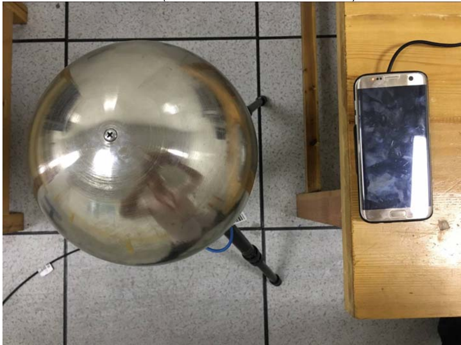
Right Side(measurement distance of 15cm)