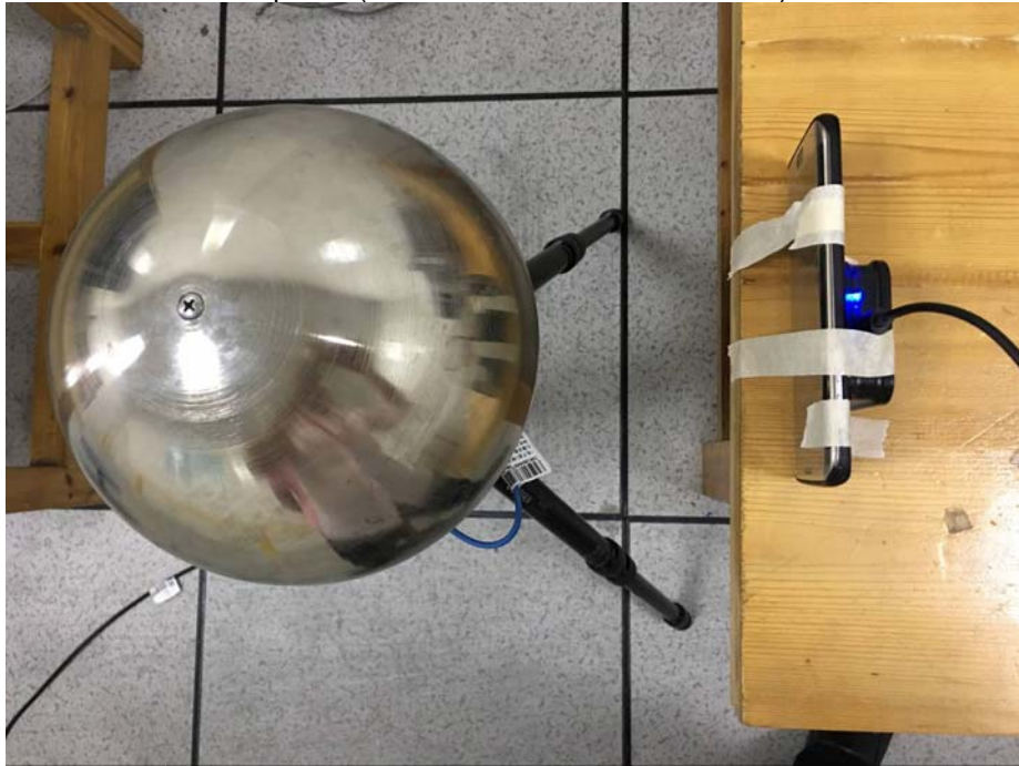
Bottom Side(measurement distance of 15cm)