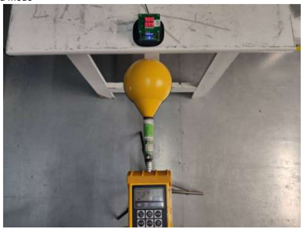
For No load mode